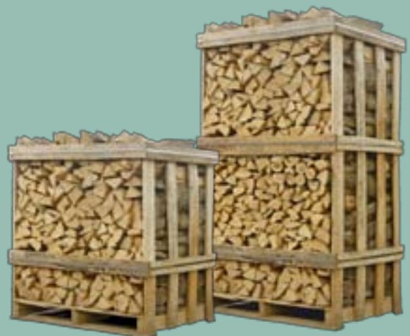
Half Pallet - 1m³