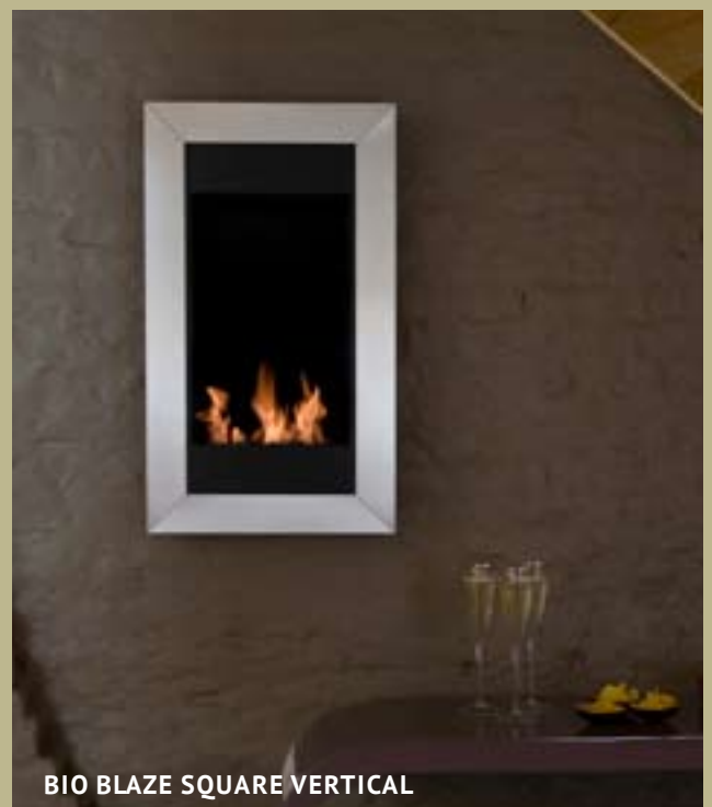
BIO BLAZE SQUARE VERTICAL

They do not require any installation, nor do they release any smoke, or fumes into the atmosphere. They have a realistic flame, good output and low running costs making the design of the Bio Blaze fireplaces a great choice for your interior and exterior decoration.